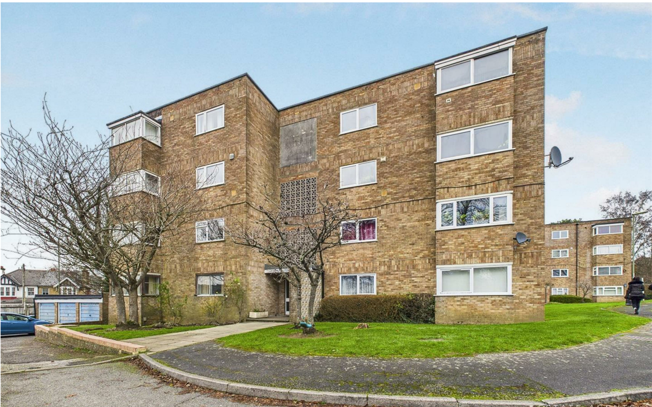
Ashley Lodge, Basingstoke, RG21 3NE £180,000 Guide price - Leasehold